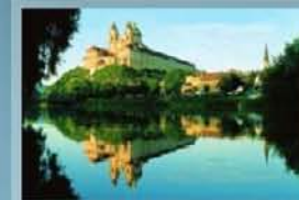
The Babenberg Leopold I, a margrave selected the fortress in Melk as his residence and his successors showered Melk with valuable treasures and relics. In 1089, Margrave Leopold II bequeathed the fortress to Benedictine monks from Lambach. The Benedictines have lived and worked here without interruption ever since in accordance with the Rule of St. Benedict.

In Melk we can review the wonderful yet strenuous pilgrim route we have just covered, through the mystically tranquil and beautiful Dunkelsteinerwald between the two Baroque monasteries of Göttweig and Melk.