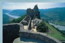
Originally built in the early 12th c, the fortress was destroyed in the Turkish siege of 1529 and rebuilt in Renaissance style.

The pilgrim route takes us past the "Seven Tombstones", believed by some to mark burial mounds dating to Illyrian Celtic times, and the "Red Cross", an old shrine of the type seen throughout Austria. From there, we proceed to Schoberstein and