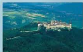
The Baroque abbey complex was built by the architect Johann Lucas von Hildebrandt to replace an older monastery on the same site which was destroyed by fire in 1718.

Our starting point is the Abbey of Göttweig, often called "Austria's Montecassino" in an allusion to the Italian abbey where the Benedictine Order originated.