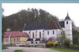
The pilgrimage to Maria Langegg took on great significance under the Servite convent, which was put in charge of the site in the mid-1600s. The chapel, built in 1605 as a sacred monument to the healing of the sick, was expanded in the Baroque period. The church "Maria - Salvation for the Sick" soon became known as a place where prayers were answered and miraculous cures occurred.